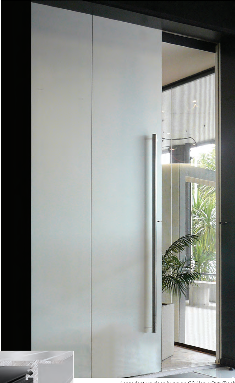
Large feature door hung on CS HeavyDutyTrack.

The track is supplied in a clear (natural) anodized finish, making it suitable for interior or exterior use.