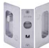
CONFIGURATION C Privacy with Left Hand Snib and Right Hand Blank