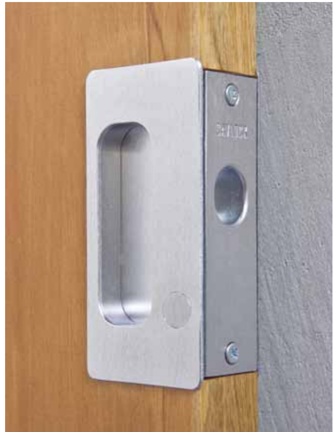
▲ A CaviLock CL200 Passage in satin chrome.