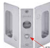
CONFIGURATION E Passage with Striker (a mating partner for bi-parting doors, to match the Privacy A, B or C Configurations) - Both Sides Blank

Note: Configuration B and C not recommended in single access situation as there is no emergency release function on this handle.