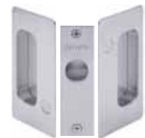
CONFIGURATION D Passage - Both Sides Blank