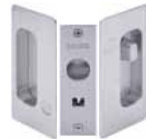
CONFIGURATION B Privacy with Right Hand Snib and Left Hand Blank