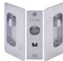
CONFIGURATION A Privacy with Right Hand Snib or Snib / Emergency (option when fitting)

◀ A CaviLock CL200 Privacy in satin chrome.